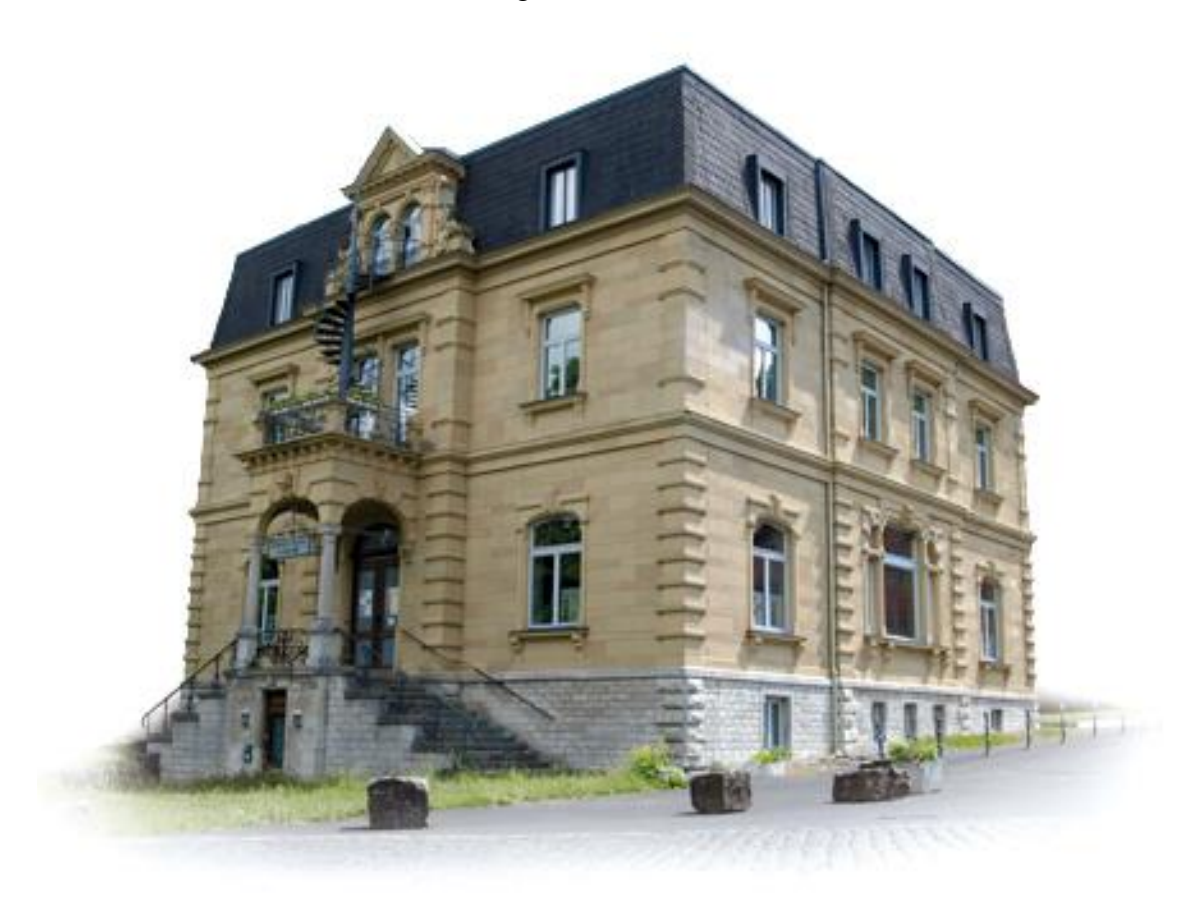
Siebold Museum Würzburg