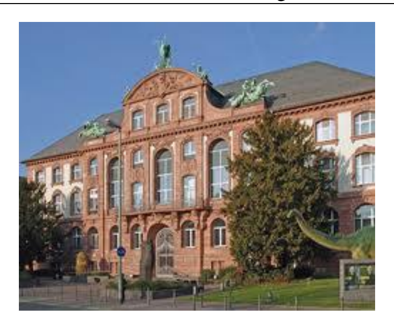
Senckenberg Museum Frankfurt/Main

(8th Siebold Collections Working Conference)