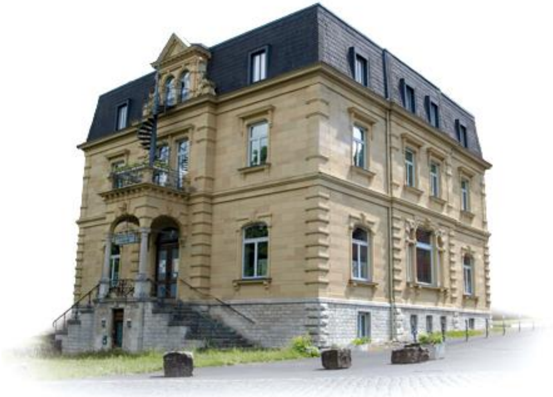
Siebold Museum Würzburg