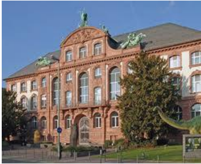
Senckenberg Museum Frankfurt/Main